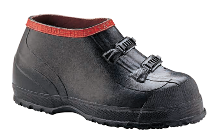
T469 | Black/Red Trim, 5"