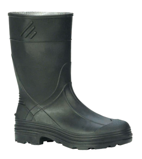
76001, 76002 | Black, 10"