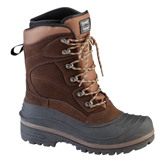
RP613 | Chocolate Brown/Otter, 11"