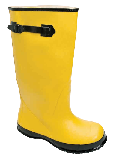
A380 | Yellow/Black, 16"