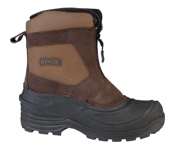
RP119 | Brown, 10"