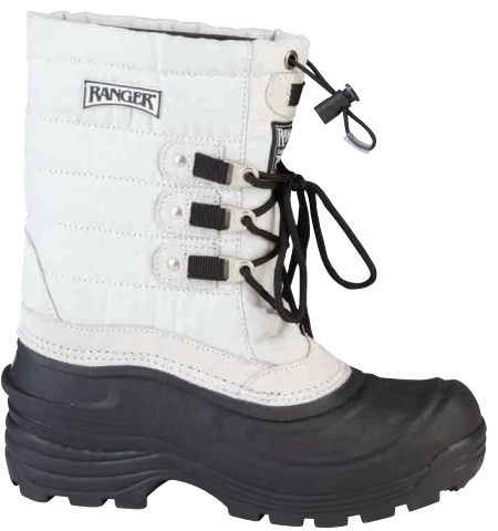
RPW111 | White/Black, 11"