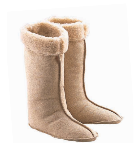
28000 | Tan, 16"

Men's Sizes: S (6 - 7), M (8- 9), L (10 -11), XL (12 - 13), XXL (14 - 15) (Whole Sizes)