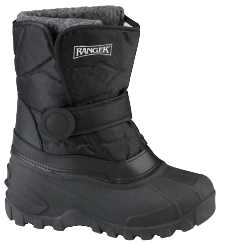
RPC332 | Black, 9"