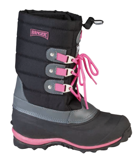
RPC312 | Black/Grey/Pink, 10"