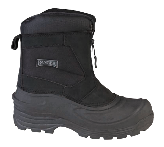
RP118 | Black, 10"