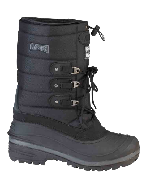
RP115 | Black, 13"