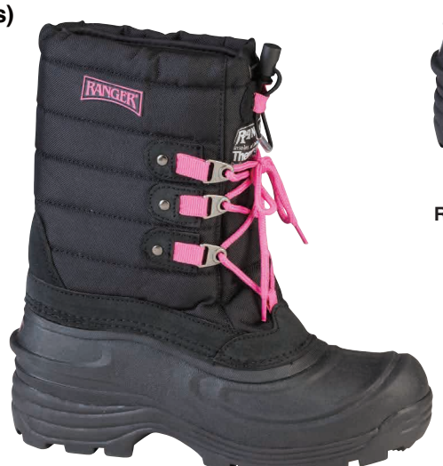
RPW112 | Black/Pink, 11"