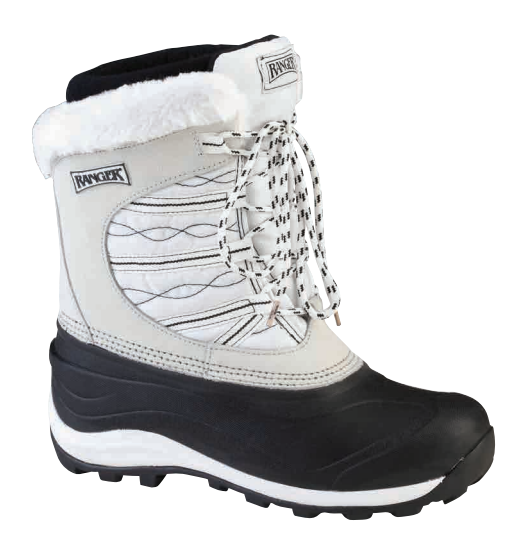
RPW119 | Chocolate Brown/Otter, 11"