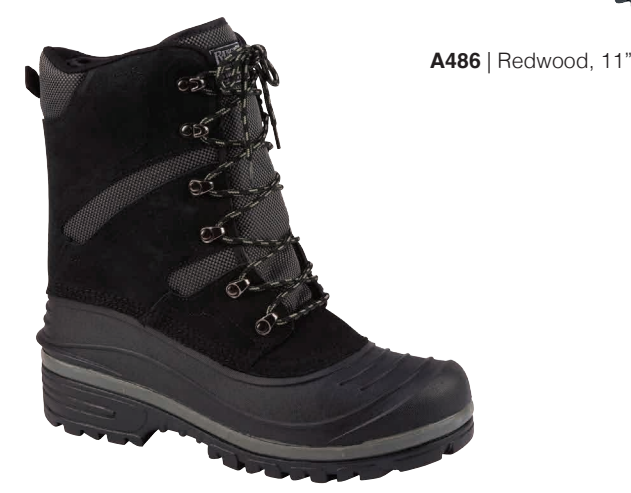
A487 | Black, 11"