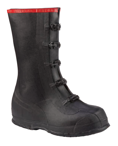
T369 | Black/Red Trim, 15"