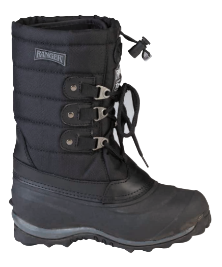
RPC310 | Black, 10"